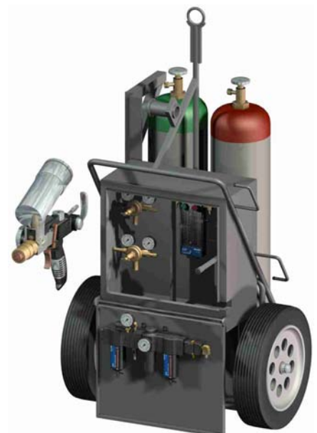
Roadrunner Mobile Combustion Powder Flame Spray System