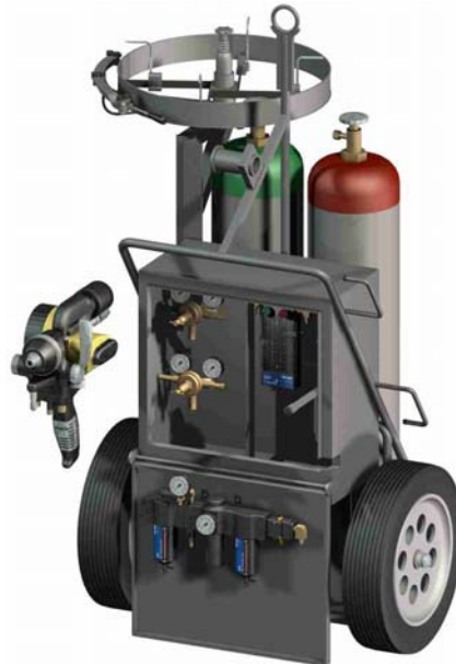
Roadrunner Mobile Combustion Wire Flame Spray System